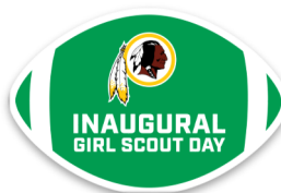
2018 Redskin's Girl Scout Day Patch