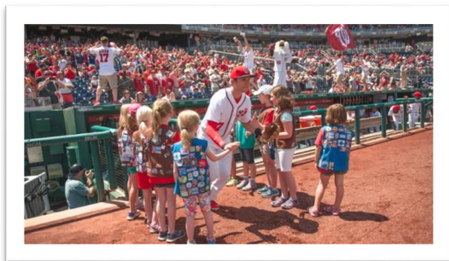
2018 Girl Scout Day at National's Park