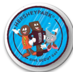
2018 Hersheypark Girl Scout Day Patch

Girl Scouts Nation's Capital partners with organizations whose policies and operations are compatible with values of Girl Scouting on a Council-level. Proceeds from sales benefit SHARE, however, may not be credited towards troops, service units, or associations. This year, we are partnering with the Washington Nationals, Washington Redskins and Hersheypark for Girl Scout Days! Proceeds from sales benefited SHARE.