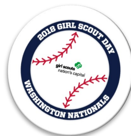
2018 National's Girl Scout Day Patch

For more information on other ways to give to SHARE, call the Annual Giving Specialist at 202-534-3785