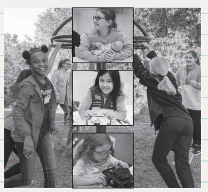
Visit www.fairfaxcounty.gov/parks/wp-scouting.htm for information about prescheduled Petal, Badge, Fun Patch and Journey Programs. Scheduling options are also available "by request".

Learn skills in Cooking • Camping Science • and more!