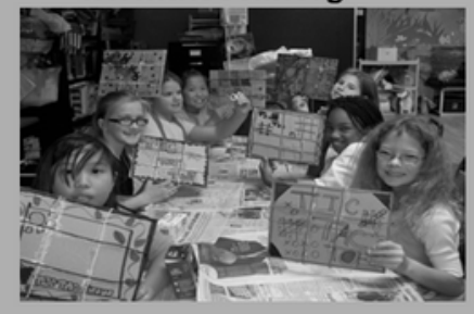
Badge & Journey Workshops for all levels

25 Silopanna Road Annapolis, MD 21403 410.990.1993 www.theccm.org