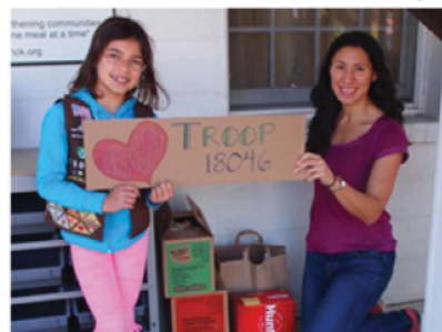
Girl Scout Troop 1804 Food Drive