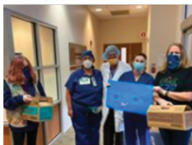
Girl Scout 1645 Deliver Cookies to INOVA Hospital

I had to stop and reflect after watching a video from Girl Scout Troop 5686. They are encouraging their Girl Scout sisters to use this time constructively for self-improvement. Watch their inspiring video .