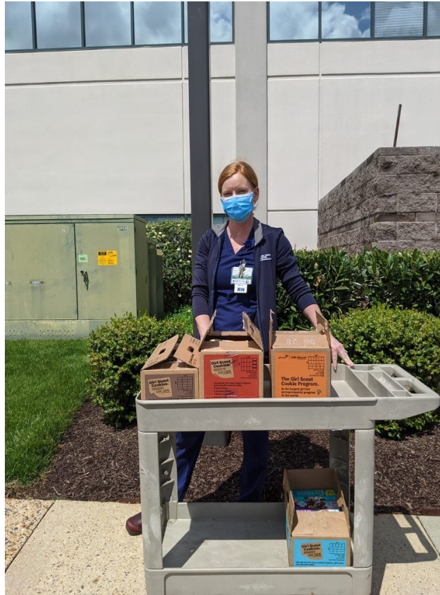
Girl Scout Troop 70135 donated cookies to Inova Loudoun Hospital's Emergency Department.

During these challenging times, it is inspiring to see what Girl Scouts are doing. Keep sending us your stories here .