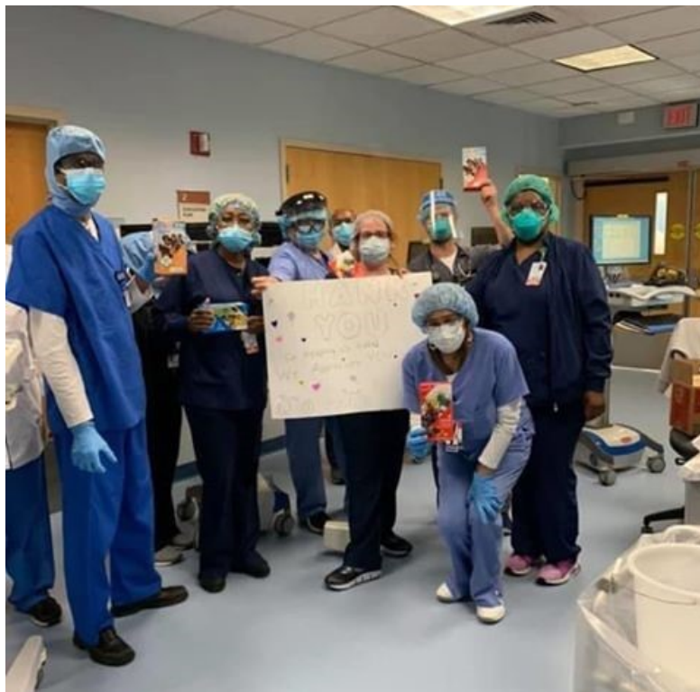
Girl Scout Troops 4508, 5401, 3758 donated over 200 boxes of Girl Scout cookies to Doctors Hospital ICU unit in Lanham, Maryland.